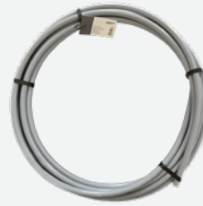
PA rolled pipe